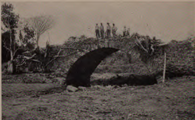
Among the ruins of Old Panama